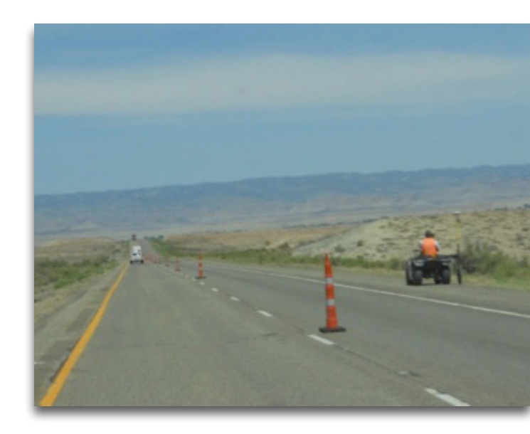
The winning contractor conducted five passes at 25 ft intervals on both eastbound and westbound lanes for a GPS survey.

Upon receipt of the GPS survey, CDOT used MicroStation and InRoads design automation tools to create a vertical profile model with projected milling depths to reduce the bumps and dips present in the existing profile. CDOT established the finished grade (paving) profile that would correct the extremely poor riding surface and provide for an acceptable ride for the 75 mph speed limit.