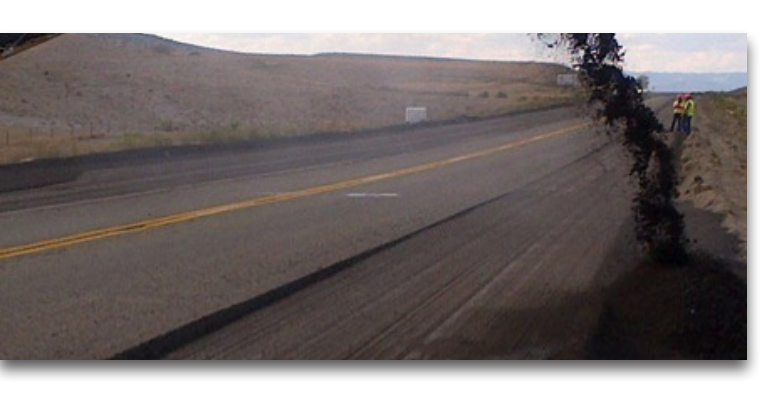
Milled Segment of I-70 Reveals Asphalt Depth Variance.

Over the years, paving, asphalt overlays, and expansive soil conditions caused very severe longitudinal undulations in the pavement on stretches of I-70 in Colorado, resulting in a ride so rough that drivers were unable to travel at speeds approaching the 75 mph speed limit. The infrastructure needed to be corrected, but using traditional mill and fill or mill and concrete overlay would have simply maintained the existing profile, which was not acceptable to begin with. CDOT opted for a variable depth mill and "whitetopping," or resurfacing the roadway with concrete instead of asphalt.