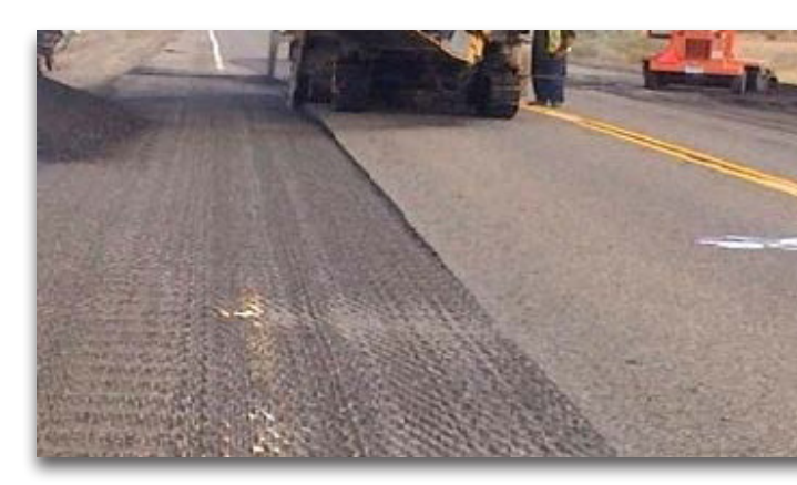
In some spots there was near zero depth to mill and maintain the sub structure for the whitetopping.

related to the need for an accurate initial survey to provide bidders with as much "known" information as possible so that they can compile a more accurate bid and develop a more costefficient process for conducting the project. Uncertainty in the bid process leads to higher bid prices since bidders must factor their perceived risk into bid prices. Had CDOT established the finished grade profiles as part of the bid documents, bidders' uncertainty could have been greatly reduced, which would likely have been reflected in lower bid prices and more accurate production rate and materials estimates.