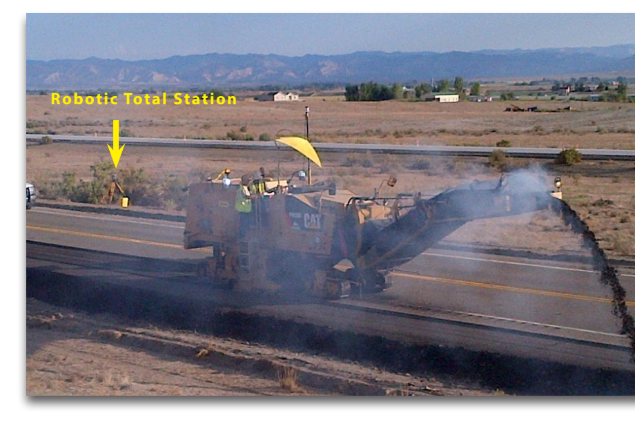
The antenna extending above the umbrella canopy on the milling machine receives wireless communication from the robotic total station. The operator controls the lateral movement of the machine, but the vertical movement is guided by AMG. The track height adjusts automatically to meet the profile, milling to an elevation 6 inches below the finished grade.

On the I-70 project, the milling machine was operated by contractor personnel, but the milling itself was controlled by the onboard computer,