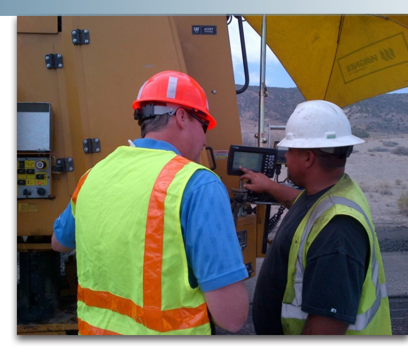
The machine operator reads the screen, which tells him where there are deviations from the pre-set model.

For example, due to the limited construction season for paving in Colorado, the project schedule was very tight. CDOT did not have enough time in design to collect the topology survey data necessary to generate a final grade profile prior to formally requesting bids. The agency arranged the project so that the