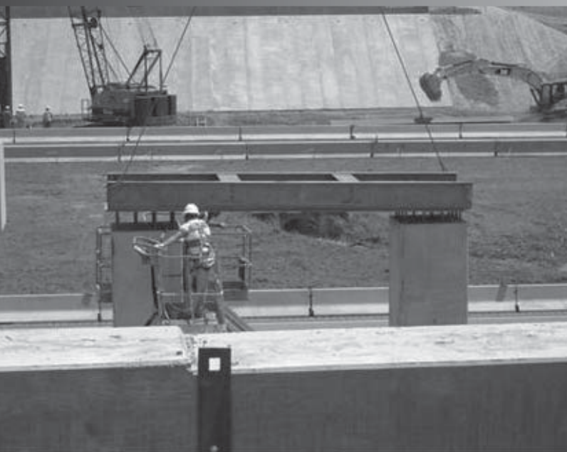
Worker on the Georgia Highways for LIFE project uses a template to check the alignment of prefabricated bridge columns.